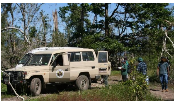
Girringun artists and rangers prepare for Arts workshop with CSIRO researchers, Gyambol Wetlands.