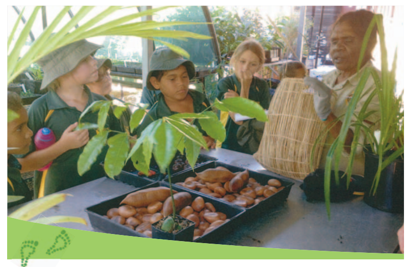
Collaborative governance of country protects natural and cultural values.