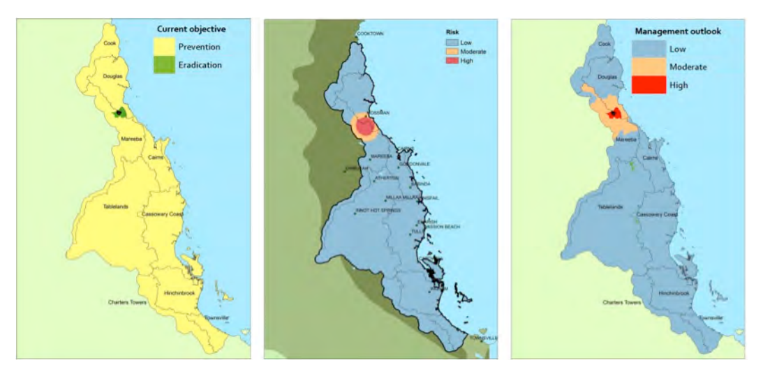
Figure 2. Current management objective (from Local Area Pest Management Plan), PARS risk assessment and future management outlook resulting from PARS process.

Future risk and investment outlook Using the process matrix shown in Figure 1, the future risk profile and management investment outlook can be generated (Figure 2). The risk profile indicates an increasing risk in the Mareeba and Douglas LGAs. The investment outlook thus reflects an ongoing high